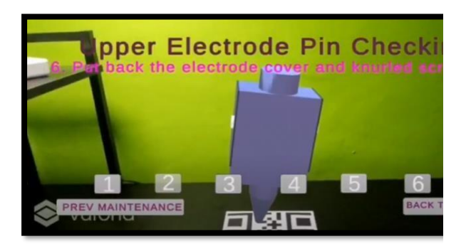
Fig. 6(c). The step-by-step procedure of the AR application for upper electrode pin checking.