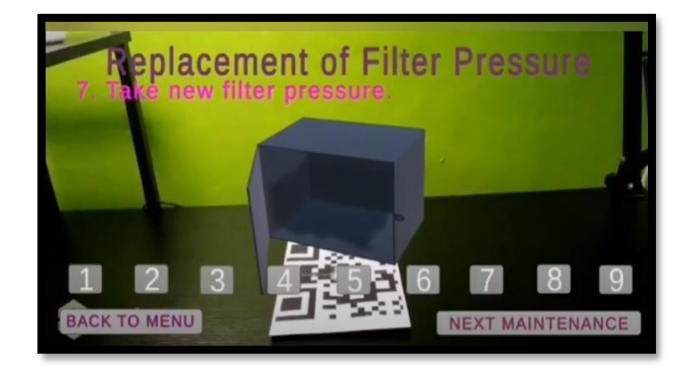
Fig. 5 (b). The step-by-step procedure of AR application for replacement of filter pressure.