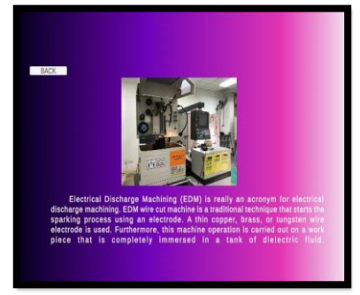
Fig. 3. The description page of EDM wirecut machine.