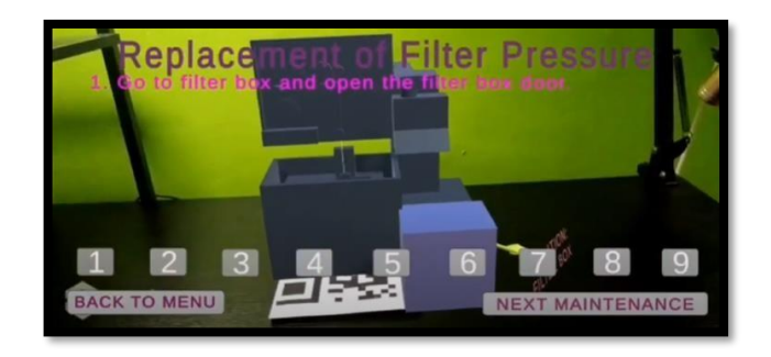
Fig. 5 (a). The step-by-step procedure of AR application for replacement of filter pressure.

In addition, the pointer in yellow always appears to indicate the location of the filter box. This procedure guides the user to identify the location of the filter box before the maintenance begins. There are 9 steps described in the AR with several examples shown in the figure below.