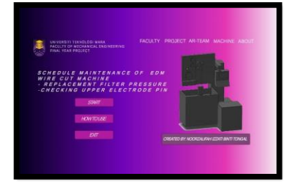
Fig. 2. The main page of the AR application.