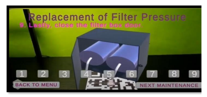
Fig. 5 (c). The step-by-step procedure of AR application for replacement of filter pressure.