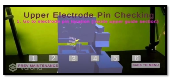
Fig. 6(a). The step-by-step procedure of the AR application for upper electrode pin checking.