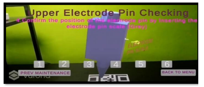
Fig. 6(b). The step-by-step procedure of the AR application for upper electrode pin checking.